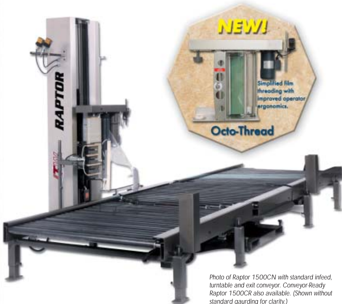
Photo of Raptor 1500CN with standard infeed, turntable and exit conveyor. Conveyor-Ready Raptor 1500CR also available. (Shown without standard guarding for clarity.)