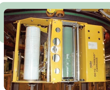
Octo-Thread film carriage

With its rear opening film loading gate, the Octo-Thread film carriage allows for fast, easy and safe film threading. The standard tilting film mandrel allows the operator to load a film roll with greater ease. It also reduces the risk of damaging the film roll during loading.